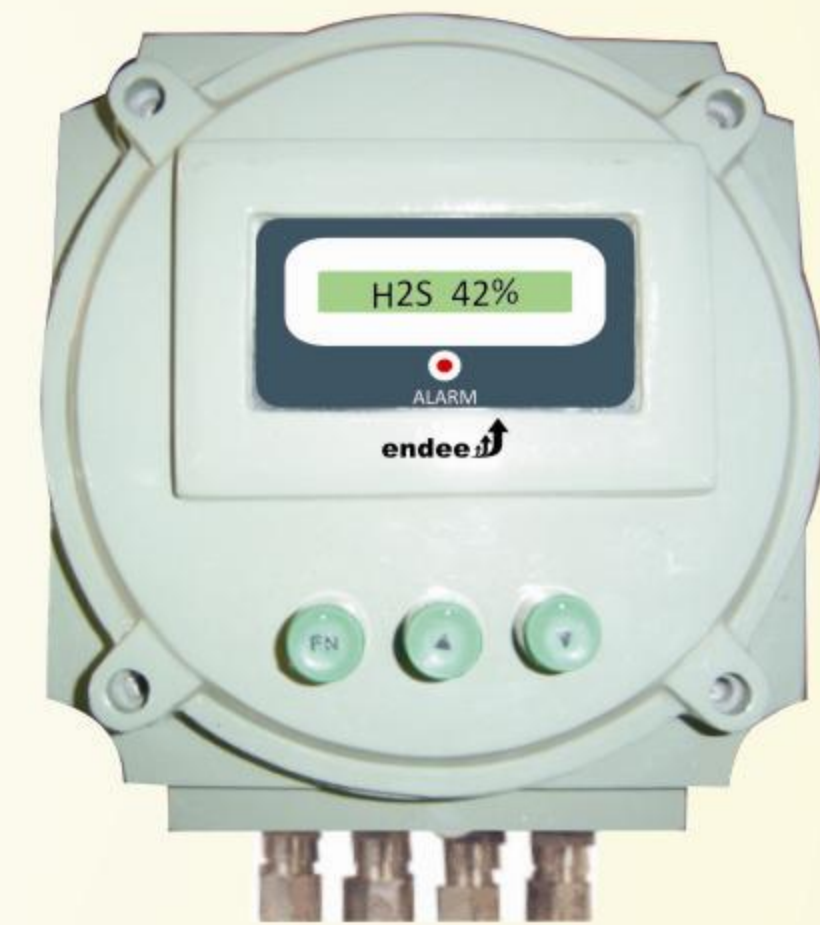
BA 461 EX

A continuous surveillance of the produced biogas is necessary to efficiently control the production process of a biogas plant. Methane, Residual oxygen, carbon dioxide & hydrogen sulphide in the gas stream can be measured simultaneously or singularly.